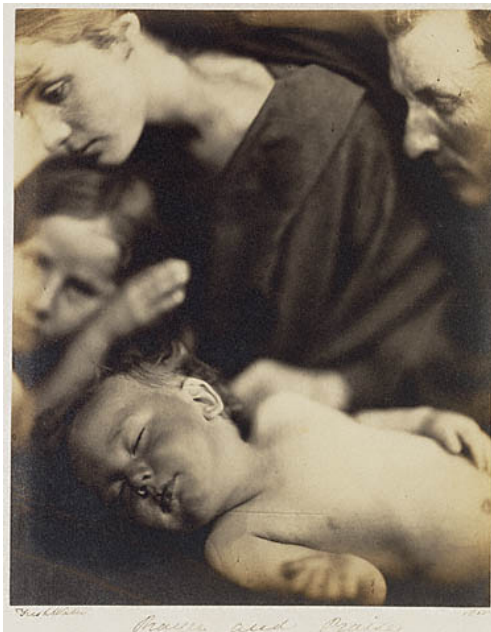
Prayer and Praise" by Julia Margaret Cameron British, Freshwater, Isle of Wight, 1865 Albumen print

From a sermon of Isaac of Nineveh, 7th Century bishop